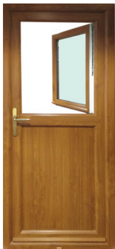
Stable Door Tilt and Turn Window, Over a Tongue and Groove Panel