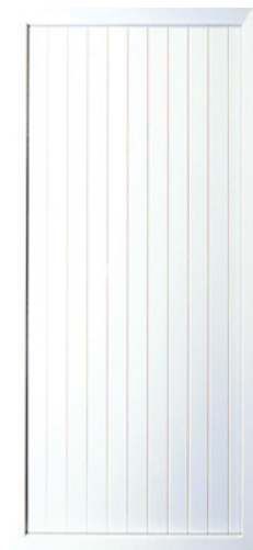
Solid Door Full Tongue and Groove Panel