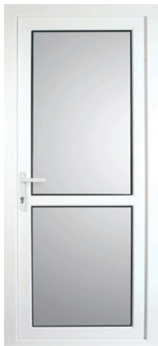
Glazed with Mid-Rail Door Toughened Glass with a 900mm Mid-Rail