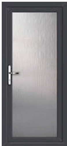
Fully Glazed Door Toughened 'A' rated Glass