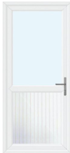
Back Door Glass Over Panel (Georgian, Tudor or Tongue and Groove)