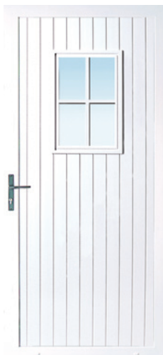
Cottage Door Solid Panel with a Small Window